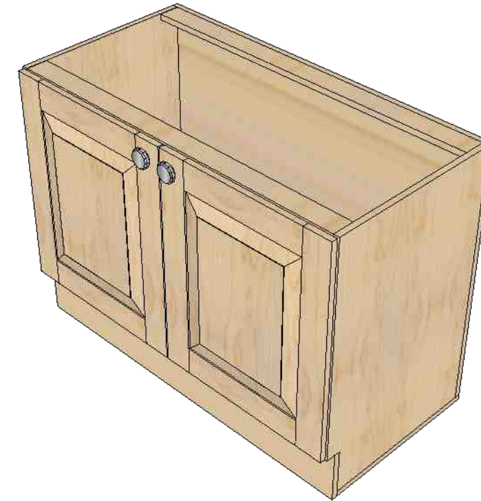
D :: 3D 001 scale: <Scale>